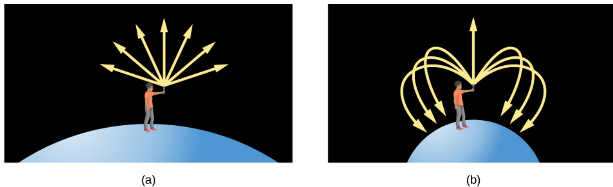
Figure 24.14 Light Paths near a Massive Object. Suppose a person could stand on the surface of a normal star with a flashlight. The light leaving the flashlight travels in a straight line no matter where the flashlight is pointed. Now consider what happens if the star collapses so that it is just a little larger than a black hole. All the light paths, except the one straight up, curve back to the surface. When the star shrinks inside the event horizon and becomes a black hole, even a beam directed straight up returns.

General relativity tells us that gravity is really a curvature of spacetime. As gravity increases (as in the collapsing Sun of our thought experiment), the curvature gets larger and larger. Eventually, if the Sun could shrink down to a diameter of about 6 kilometers, only light beams sent out perpendicular to the surface would escape. All others would fall back onto the star ( Figure 24.14 ). If the Sun could then shrink just a little more, even that one remaining light beam would no longer be able to escape.