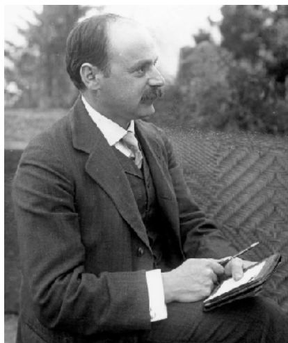
Figure 24.15 Karl Schwarzschild (1873–1916). This German scientist was the first to demonstrate mathematically that a black hole is possible and to determine the size of a nonrotating black hole’s event horizon.

The characteristics of an event horizon were first worked out by astronomer and mathematician Karl Schwarzschild ( Figure 24.15 ). A member of the German army in World War I, he died in 1916 of an illness he contracted while doing artillery shell calculations on the Russian front. His paper on the theory of event horizons was among the last things he finished as he was dying; it was the first exact solution to Einstein’s equations of general relativity. The radius of the event horizon is called the Schwarzschild radius in his memory.